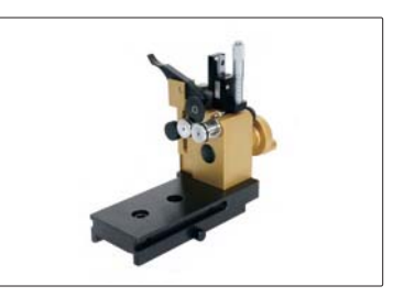
Concentric clamp (included)